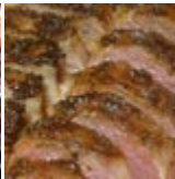
Rack Of Lamb